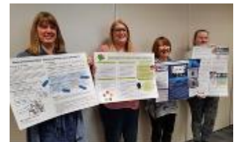
WYRE Project participants, 2018

Please note, this opportunity is for Primary Teachers only.