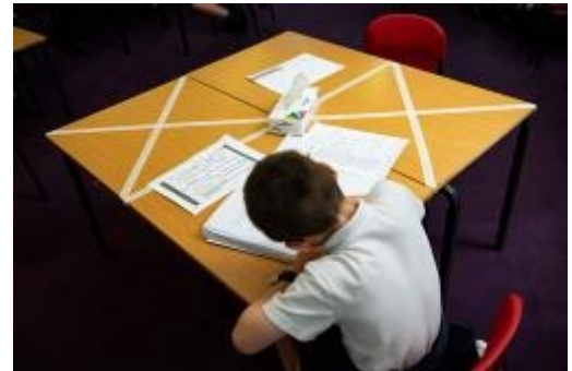
Pupils and teachers will be getting used to new ways of working.